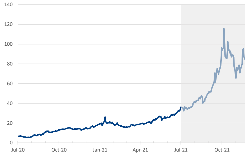
Figure 1: Dutch TTF gas price (€/MWh)

Parkmead's FY21 financial results to end-June were dominated by the backdrop of COVID-19 induced commodity price volatility through the year, with Dutch TTF gas prices starting the period at heavily depressed levels of ~€6/MWh, rallying to end the year at ~€35/MWh.